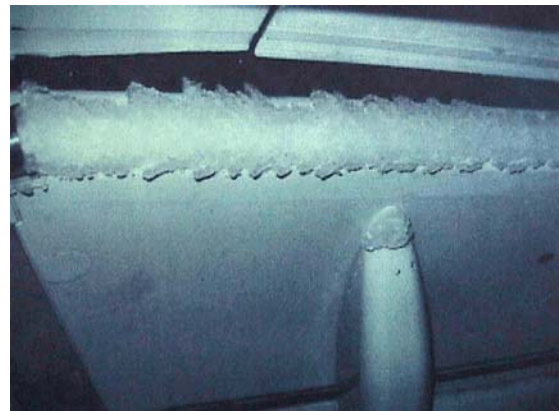
Photo 1. Ice accretion on main flaps leading edges from a December 1998 A321 event

In December 1998, two similar events occurred involving a foreign carrier's A321 aircraft landing in CONFIG FULL in icing conditions. The roll oscillations were attributed to ice accretion, particularly on the flap leading edges, affecting the slot between the main flaps and wing box. Because the main flaps are similar on the A320 and A321, and no events of this nature were ever reported on the A320, the icing conditions were considered to have caused the events and no changes to the